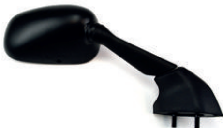
COD. 3841114 HERT Lato: dx Passo: - Colore: nero Note: - E