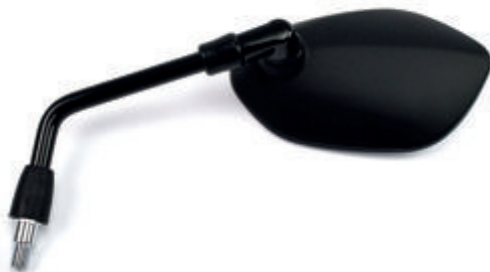
COD. 3841017 HERT Lato: sx Passo: Ø 10x1.25 dx Colore: nero Con adattatore cromato. Note: - E