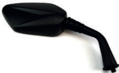
COD. 3841102 HERT Lato: dx Passo: Ø 10x1.25 Colore: nero Note: - E