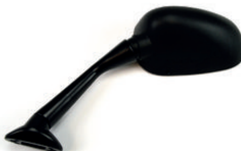
COD. 3841113 HERT Lato: sx Passo: 2 fori passanti Colore: nero Note: - E