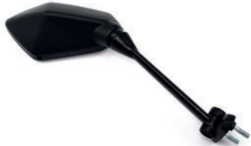
COD. 3841014 HERT Lato: dx Passo: 2 viti Ø 6x18mm - int. viti 47mm Colore: nero Note: - E