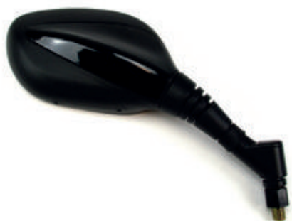
COD. 3841064 HERT Lato: dx Passo: - Colore: nero Note: - E