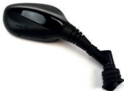
COD. 3841066 HERT Lato: dx Passo: Ø 10x1.25 dx Colore: nero Note: - E