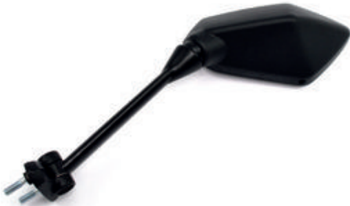
COD. 3841013 HERT Lato: sx Passo: 2 viti Ø 6x18mm - int. viti 47mm Colore: nero Note: - E