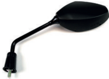
COD. 3841097 HERT Lato: sx Passo: Ø 8x1.25 Colore: nero Note: - E