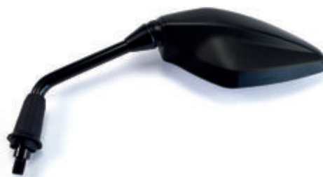
COD. 3841111 HERT Lato: sx Passo: Ø10x1.25 Colore: nero Note: c/adattatore. E