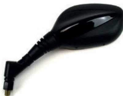
COD. 3841065 HERT Lato: sx Passo: - Colore: nero Note: - E