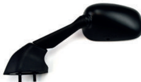
COD. 3841115 HERT Lato: sx Passo: - Colore: nero Note: - E