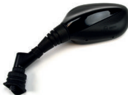
COD. 3841067 HERT Lato: sx Passo: Ø 10x1.25 dx Colore: nero Note: - E