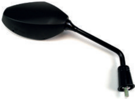
COD. 3841096 HERT Lato: dx Passo: Ø 8x1.25 Colore: nero Note: - E