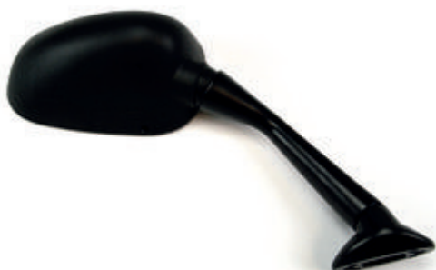
COD. 3841112 HERT Lato: dx Passo: 2 fori passanti Colore: nero Note: - E