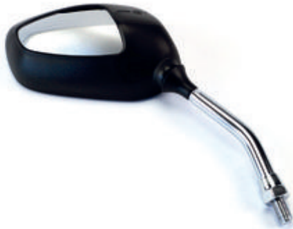
COD. 3841100 HERT Lato: sx Passo: Ø 10x1.25 Colore: nero/grigio Note: asta cromata Ø 12 mm. E