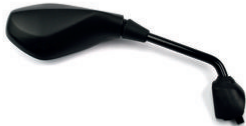
COD. 3841016 HERT Lato: dx Passo: Ø 10x1.25 dx Colore: nero Note: - E