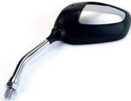
COD. 3841101 HERT Lato: dx Passo: Ø 10x1.25 Colore: nero/grigio Note: asta cromata Ø 12 mm. E