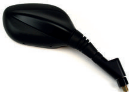
COD. 3841062 HERT Lato: dx Passo: - Colore: nero Note: - E